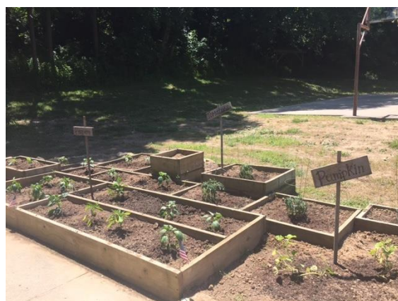
Images – Workshop and herb garden: Missouri moderate care facility, South East Region, Missouri

The boys introduced themselves and shook our hands. At this time and throughout the rest of our visits, we were struck by their social skills. It was evident throughout our visit that there was a strong emphasis on developing these skills. This aligns with their operating approach that social emotional competence is an essential component of learning, healthy development and navigating life.