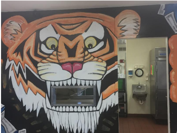
Image - Cafeteria: Missouri moderate care facility, South East Region, Missouri

We also visited a number of programs focussed on responding to family violence in the home and the needs of children and families in this context. Further information about this can be found at Appendix F.