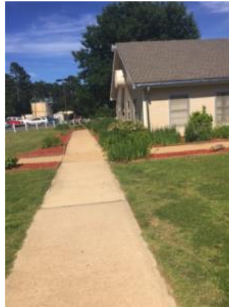
Images – Volleyball court and outside, Missouri moderate care facility, South East Region, Missouri

In New York there is also wide support for detaining young people 'close to home' to maximise their ability to reintegrate with family, school and community. Intensive support is available to enable young people to catch up and improve their education, and graduation ceremonies are commonplace within facilities. Health professionals – including dentists, doctors, psychiatrists, and alcohol and drug specialists – are regularly on site and, commonly, they are members of staff. Practical support (such as housing and job search assistance) is offered to families to maximise the prospects of successfully reuniting with the young person on release.