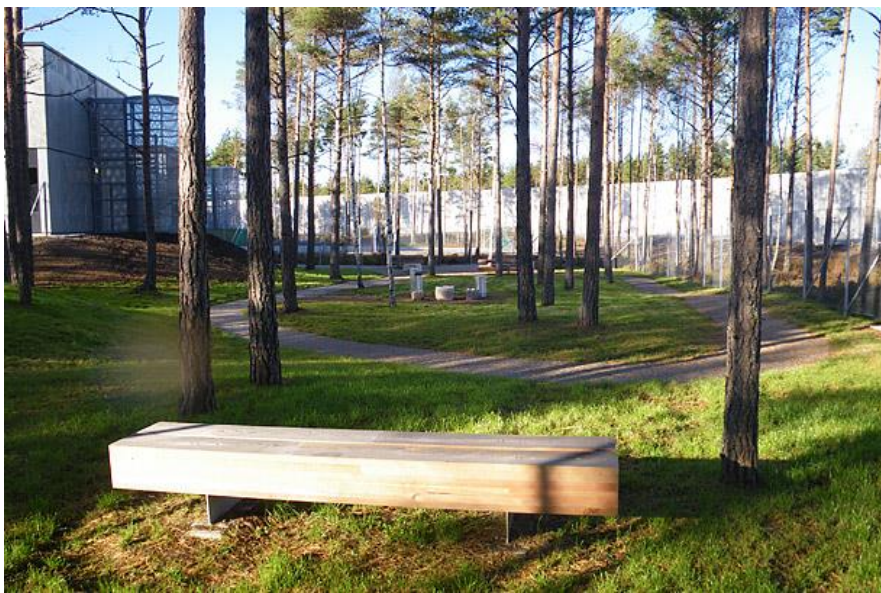
Image – Halden Prison.

A standout for us was a visit to Halden adult prison in Norway, a facility that has been labelled 'the world's most humane prison'. On entering Halden Prison, around 120km south of Oslo, we were struck immediately by the 'feeling' of the facility. Its distinctive atmosphere was no doubt influenced by numerous factors, including an attractive physical environment, a mix of both prison staff and staff from the local community, prisoners dressed in casual clothes, and relaxed interactions between people (e.g. prison officers engaging in a range of recreational pursuits with prisoners).